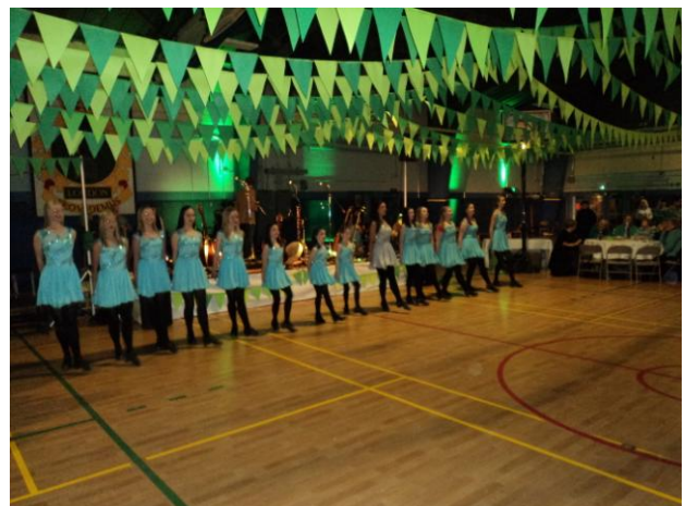
The Corrigan Dancers

This was a very successful night. We made enough to send our two 1H members to Normandy and to bring over the two students from the Westlake Brothers Souvenir (Remembrance) Association. Much beer was had by all and everyone had a great time.